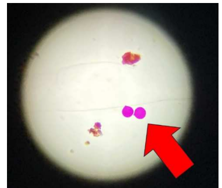
Stained cedar pollen

Temperatures in late February are expected to be normal or lower, while temperatures in March are expected to be normal or higher. Therefore, it is expected that pollen dispersion will begin by early March in the Tohoku and other areas where it has not yet started.