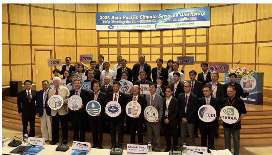
Participants together for a group picture